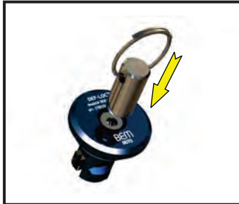
Align the Secure Key over the screw head and slip it on.