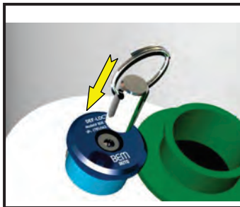
Align the Secure Key over the screw head and slip it on.