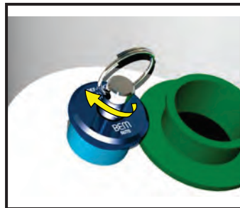
Turn the Secure Key clockwise until the screw is LIGHTLY tight.

CAUTION: Yes, we're shouting "LIGHTLY." If you overtwist the key it will break/twist off the small c-clip that holds the lock in place.