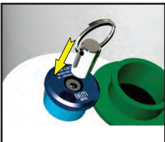
Align the Secure Key over the screw head and slip it on.