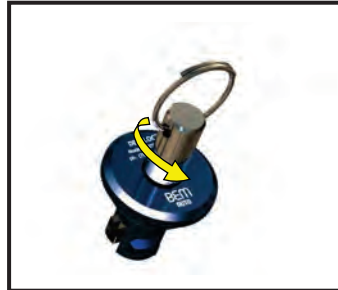
Turn the Secure Key counterclockwise until it stops.