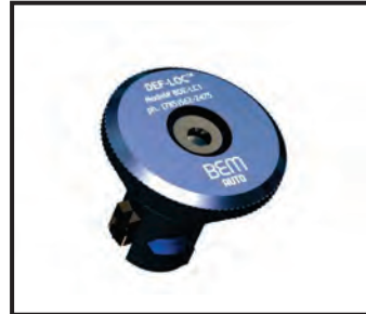
Remove Secure Key. Locking Ward will be fully up in its retracted position.