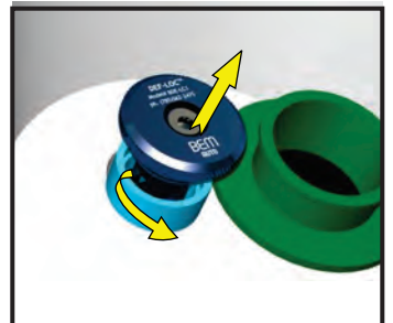
Remove the cap from the filler neck by screwing unit counterclockwise and pulling up.

Lightly tightening the Secure Screw is enough to ensure a secure system and an easy-to-unlock cap for the future.