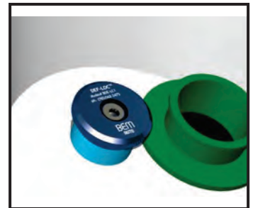
Remove Secure Key. Unit will be secured.

CAUTION: Yes, we're shouting "LIGHTLY." If you overtwist the key it will break/twist off the small c-clip that holds the lock in place.