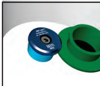
Remove the Secure Key.