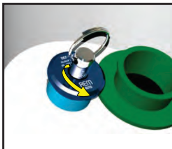
Turn the Secure Key counterclockwise until it stops. Again, do not overtorque the key. It will break/twist off the c-clip.